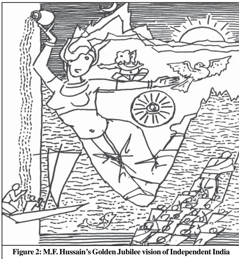
Figure 2: M.F. Husain's Golden Jubilee vision of Independent India

I look at these two temples as a process of the institutionalisation of a particular form of nationalism. These